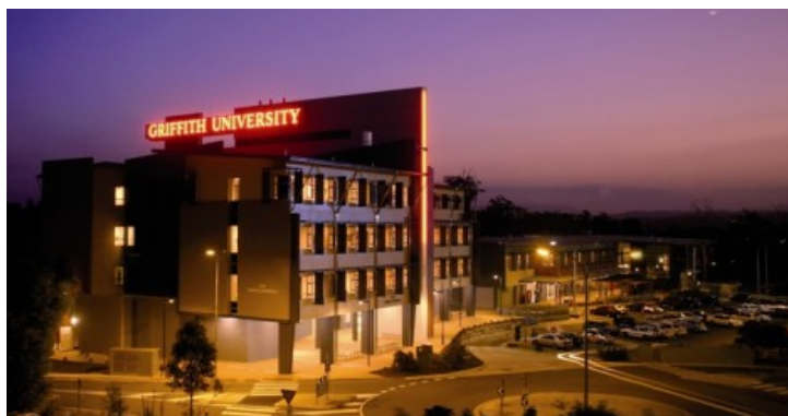
Griffith University has been named the Employer of Choice in the 2016 Women in Technology awards.

WiT is the peak industry body for women in technology and life sciences within Queensland with a vision to advance, connect and empower women in these fields.